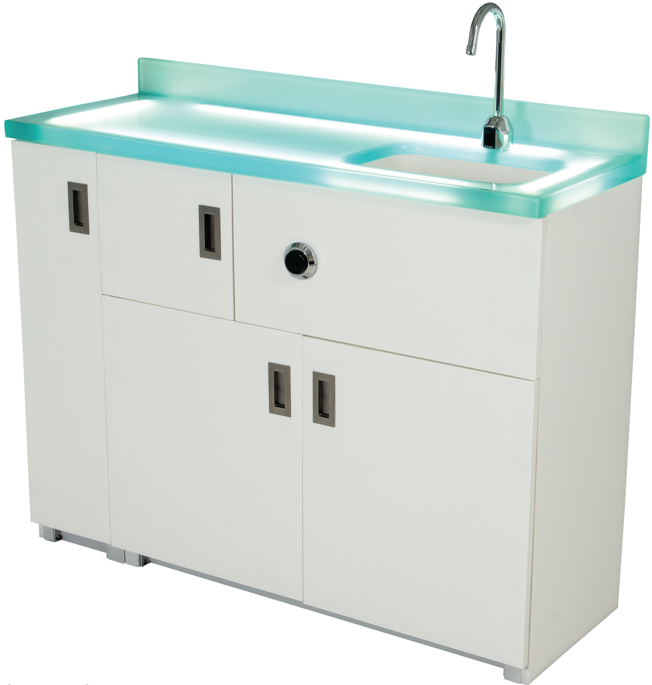
Swivette® - Swivel toilet with integrated cast resin countertop

Whitehall Manufacturing Manufacturer of Healthcare and Rehabilitation Products since 1946