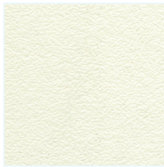
OCP-02 Arctic White