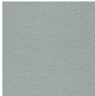
OCP-06 Dolphin Gray